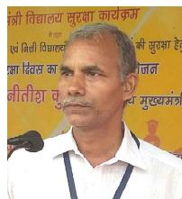
By: Er. Prabhat Kishore

The TRR will be equipped with teachers from ten themes that align with the policy objectives of NEP 2020, namely (1) Early Childhood Care and Education - The Foundation of learning, (2) Foundational Literacy and Numeracy - An Ur-